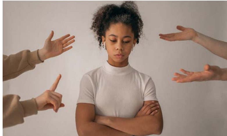
Figure 1 3 : Dissatisfied employees impact everyone in the workplace

“Some of the documented negative organizational effects that can result from STS are increased absenteeism, impaired judgment, low productivity, poorer quality of work, higher staff turnover, and greater staff friction.” 1